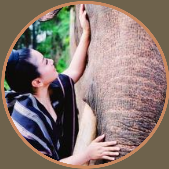
DUONG ZORIDA ACTRESS & MC