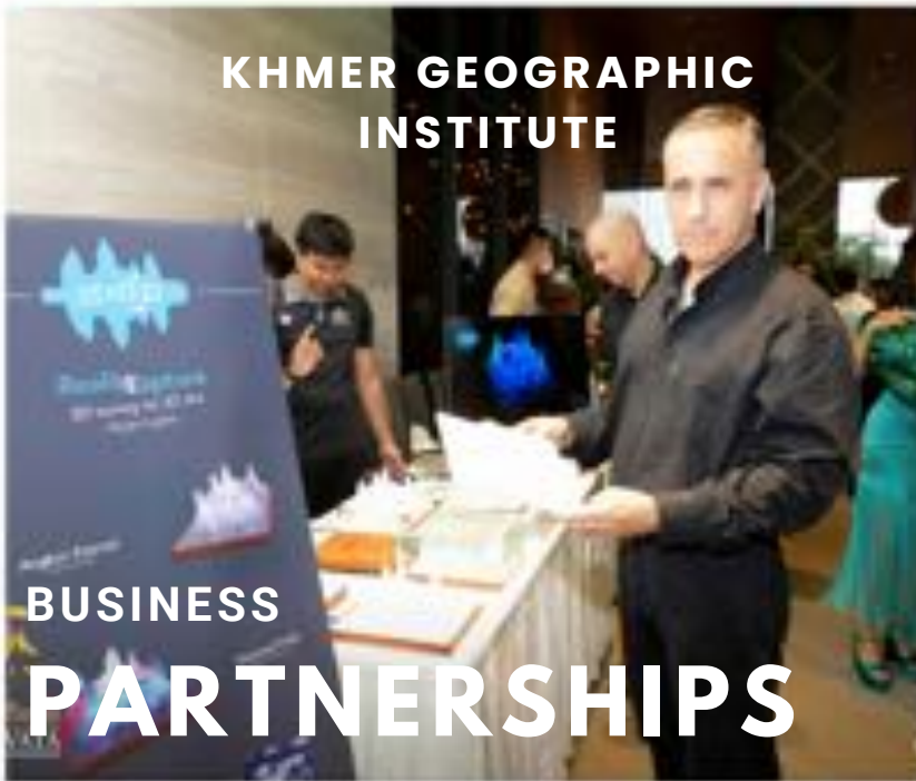
KHMER GEOGRAPHIC INSTITUTE