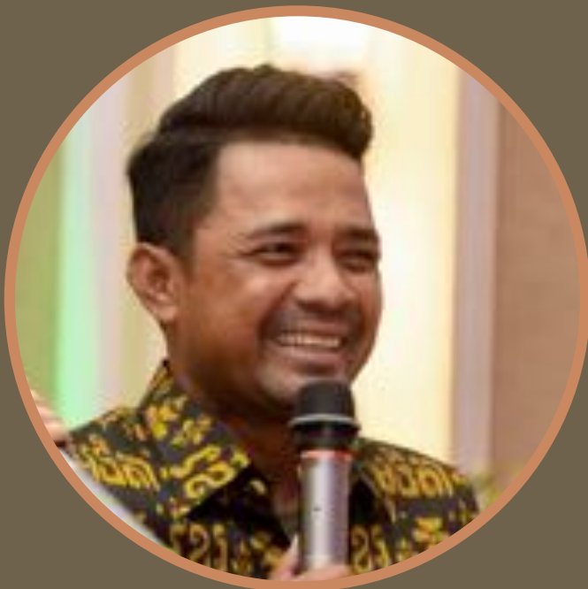
HERO TV HOST & MC